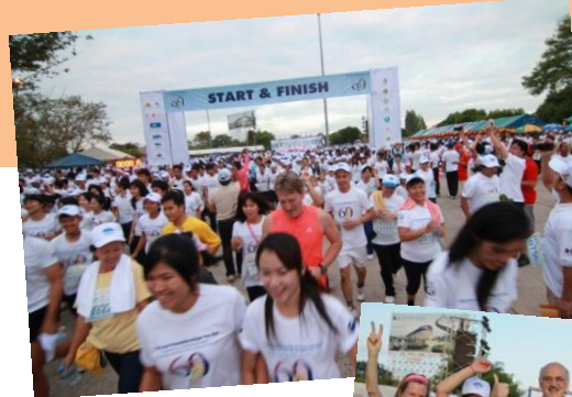
Australian Embassy Bangkok team