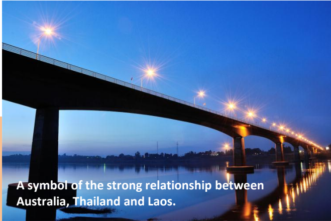
A symbol of the strong relationship between Australia, Thailand and Laos.

On 18 November 2012, over 3000 people from Australia, Thailand, Laos, and around the world participated in a 5 km fun run across the first Thai – Laos Friendship Bridge in celebration of the 60th anniversaries of Australia's diplomatic relations with Thailand and the Lao People's Democratic Republic this year. The event was organised by the Australian Embassies in Bangkok and Vientiane in cooperation with the Nong Khai Provincial Office, Nong Khai Running Club and Vientiane Capital. The Thai – Laos Friendship Bridge, the first major bridge across the lower Mekong, was constructed with funding from the Australian Government. Opened in 1994, the bridge links the town of Nong Khai in Thailand with the capital of the Lao People's Democratic Republic, Vientiane.